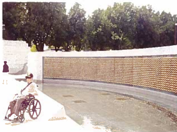
The Wall of Stars -- 4,000 stars to memorialize the over 400,000 killed in WWII