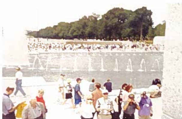
Entrance Ramp and Fountain Wall of Stars in background