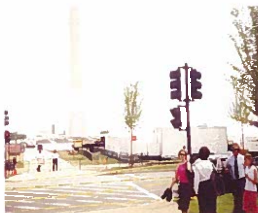
Washington Monument looking back from the Memorial