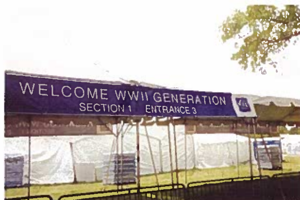
Close-up of Entrance Gate; piles are of water for the attendees donated by Wal-Mart