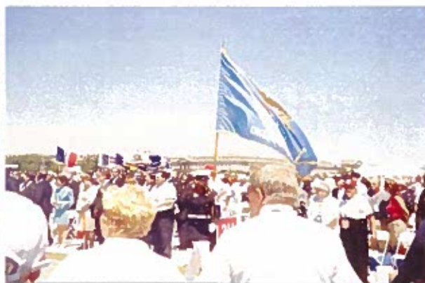
Parade of the State Flags at the Ceremony