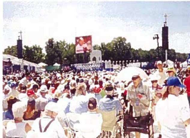
View of the Stage from our seats before the Ceremony. As is evident, we had very good seats and could see everything.