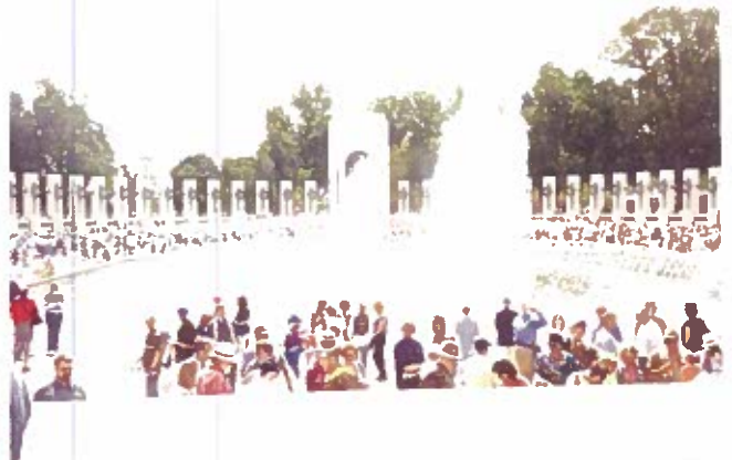
The Atlantic Column taken from the Pacific Column