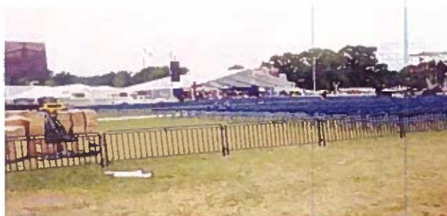
Part of the Sea of Chairs