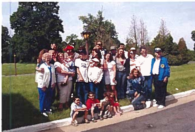
The Beilstein Clan