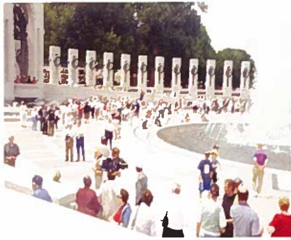
The Atlantic Column from the Entrance Steps and Ramp (pictures taken Friday, Memorial closed during Ceremony)