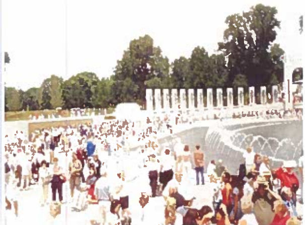
Approaching the Wall of Stars