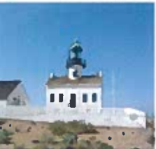
Cabrillo National Monument