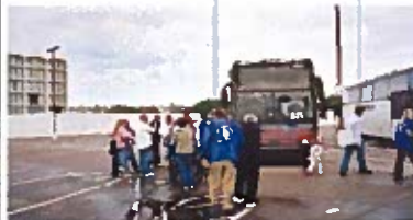
Boarding the buses