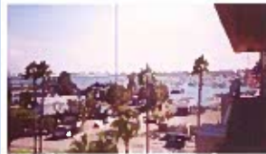
Views from the Holiday Inn