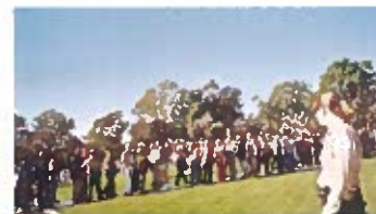
Waiting to view the memorial