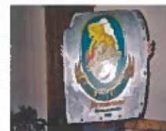
Kiel Mystery Art

Additional photos will be available in February on the 380th Website/Reunions/2005 Reunion