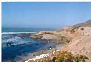
Pacific Ocean from Point Loma