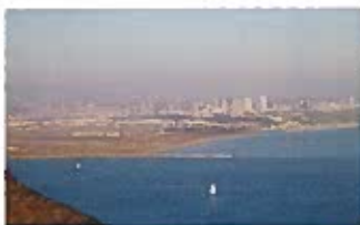
Aeronautical Museum San Diego Bay