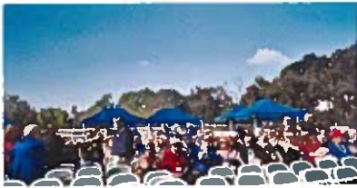
Waiting for the program to begin