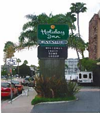
Holiday Inn Bayside