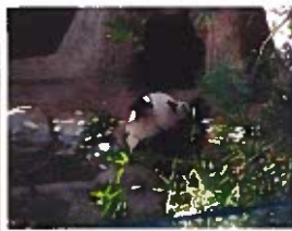
Panda at San Diego Zoo