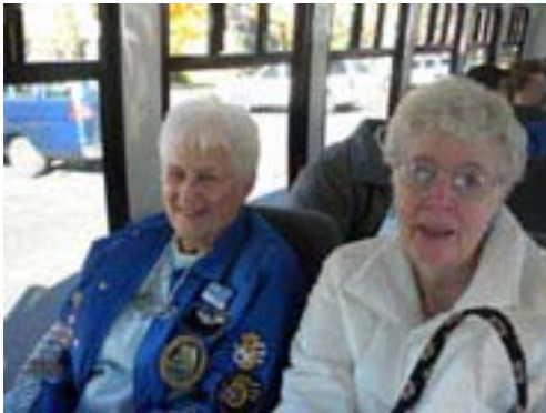
On bus ride to College of the Ozarks