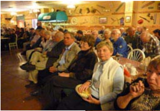
Welcome Dinner, Circle B Chuckwagon (54 attended)