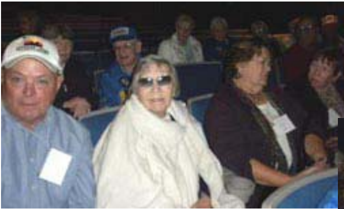
Red, Hot & Blue Show (35 attended)