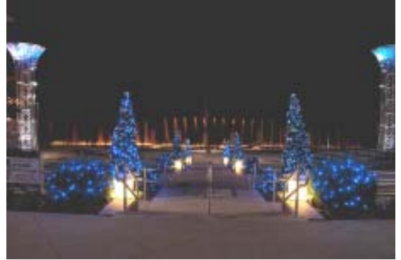
Christmas at the Riverfront, Branson