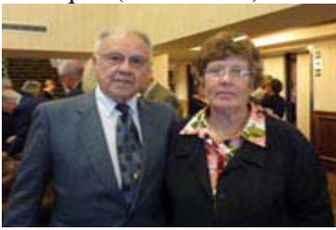
Banquet (64 attended)