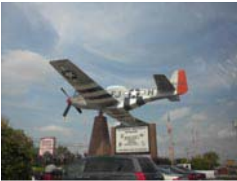
Veterans Memorial Museum (55 attended)