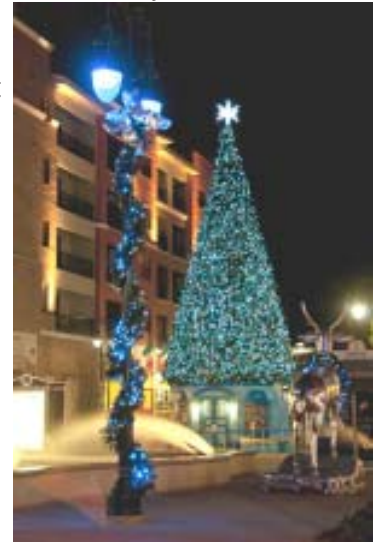
Welcome at the Grand Plaza Hotel