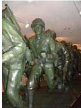
Bottom: Veterans Memorial Park