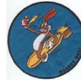
530 th -4-3/4"x4-3/4"