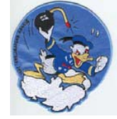
531 st - 5-1/2"x4-3/4"