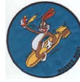
530 th -4-3/4"x4-3/4"