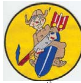
528 th -5"x5"