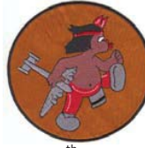
529 th -5"x5"