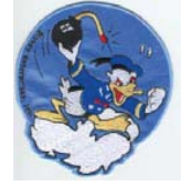
531 st - 5-1/2"x4-3/4"